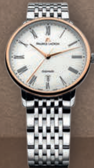
N°97.1 TRADITION LC6067-PS102-110 Automatic movement, Ø 38 mm stainless steel case / 18K pink gold bezel.