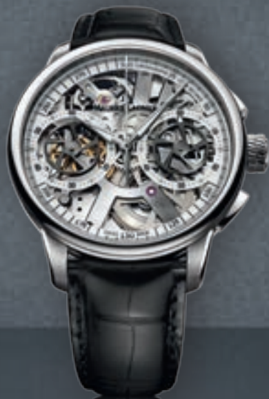
N°28.3 LE CHRONOGRAPHE SQUELETTE

MP7128-SS001-300 Hand-wound manufacture movement ML106, Ø 45 mm stainless steel case full black PVD coating. Limited Edition 188 pces.