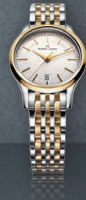
N°139.3 DATE LC1026-PVY13-130 Quartz movement, Ø 33 mm stainless steel case / yellow gold PVD coated bezel.