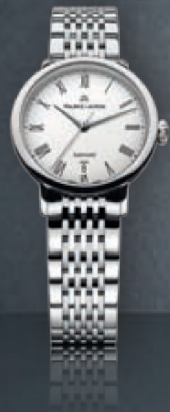
N°144.1 TRADITION LC6063-SS002-110 Automatic movement, Ø 28 mm stainless steel case.

Les Classiques Tradition effortlessly combines first class craftsmanship and restrained elegance. The slim case and simple beauty of the dial showcase the pure art of watch making, to create a truly graceful timepiece.