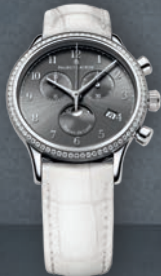
N°134.2 PHASES DE LUNE CHRONOGRAPHE

LC1087-SS001-821 Quartz movement, Ø 38 mm stainless steel case.