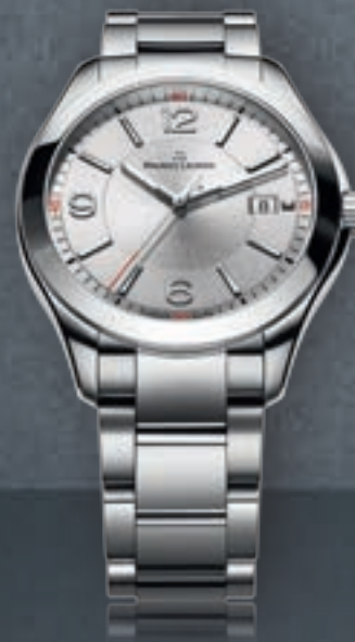
N°115.1 DATE MI1018-SS002-130 Quartz movement, Ø 40 mm stainless steel case.