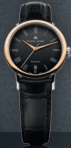
N°146.2 TRADITION LC6063-PS101-310 Automatic movement, Ø 28 mm stainless steel case/18K pink gold bezel.