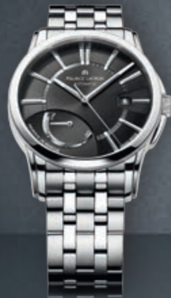
N°76.1 RESERVE DE MARCHE

Sophistication with a sense of security. The Pontos Reserve de Marche features a minimalistic dial with cut away detailing. The subtle recesses house a sleek power reserve indicator and simplistic date aperture, to create a reduced appearance that is still not short on features.