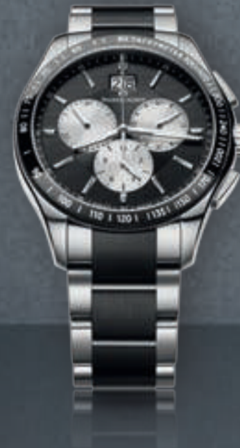
N°111.2 CHRONOGRAPHE MI1028-SS002-331 Quartz movement, Ø 41 mm stainless steel/black PVD coated bezel.