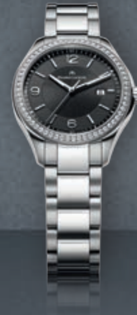
N°129.2 DATE MI1014-SD502-330 Quartz movement, Ø 32 mm stainless steel diamond set case.