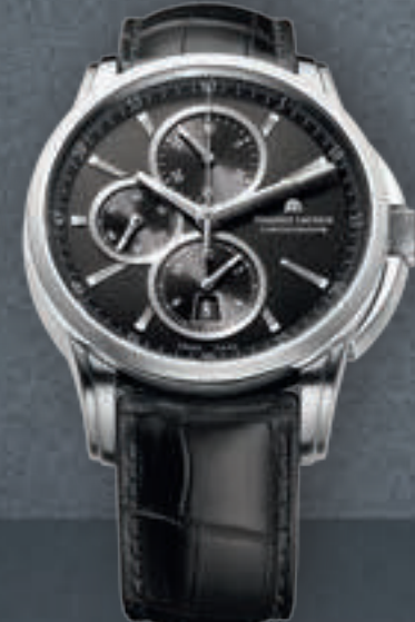
N°69.2 CHRONOGRAPHE PT6188-SS001-330 Automatic movement, Ø 43 mm stainless steel case.