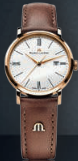
N°156.1 DATE EL1084-PVP01-110 Quartz movement, Ø 30 mm stainless steel case PVD coating in rose gold.