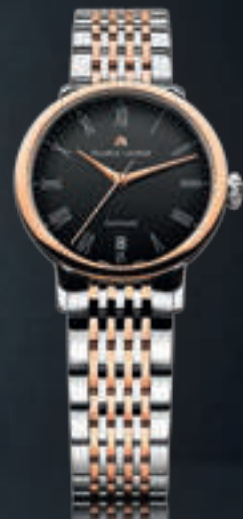
N°147.4 TRADITION LC6063-PS103-310 Automatic movement, Ø 28 mm stainless steel case/18K pink gold bezel.