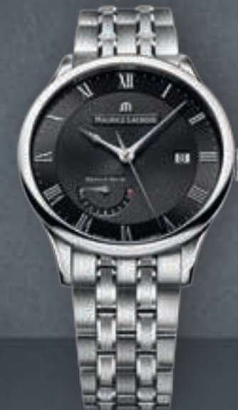
N°49.2 RESERVE DE MARCHE MP6807-SS002-310 Automatic movement, Ø 40 mm stainless steel case.