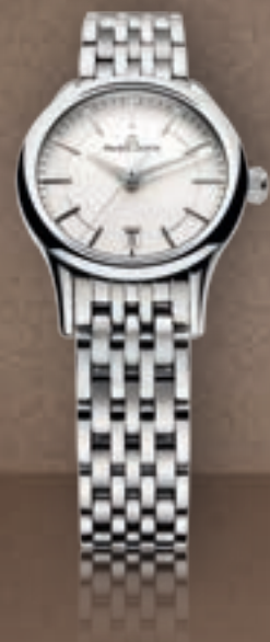
N°140.3 DATE LC1113-SS002-130 Quartz movement, Ø 28 mm stainless steel case.