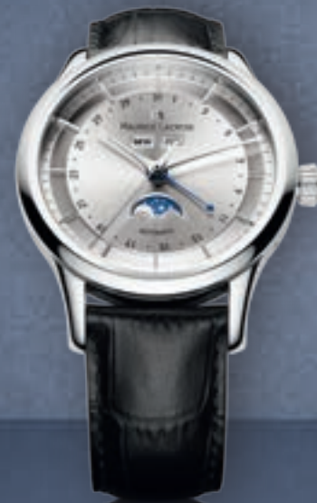
N°91.2 PHASES DE LUNE LC6068-SS001-131 Automatic movement, Ø 40 mm stainless steel case.