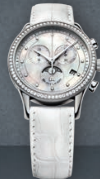
N°137.1 PHASES DE LUNE CHRONOGRAPHE LC1087-SD501-160 Quartz movement, Ø 38 mm stainless steel diamond set case.