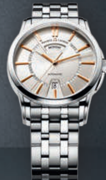
N°83.3 DAY/DATE PT6158-SS002-19E Automatic movement, Ø 40 mm stainless steel case.