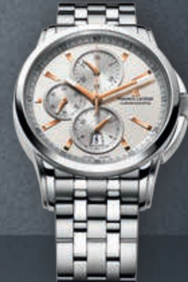
N°69.3 CHRONOGRAPHE PT6188-SS002-131 Automatic movement, Ø 43 mm stainless steel case.