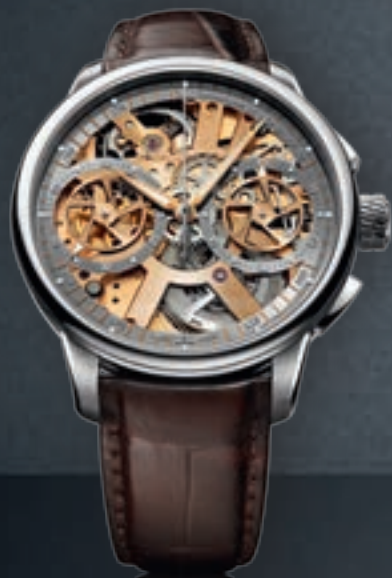
N°28.1 LE CHRONOGRAPHE SQUELETTE

MP7128-SS001-500 Hand-wound manufacture movement ML106, Ø 45 mm stainless steel case. Limited Edition 188 pces.