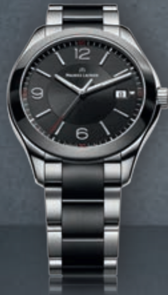
N°112.1 DATE MI1018-SS002-331 Quartz movement, Ø 40 mm black/stainless steel case.

Each quarter of the Miros Date features a small design detail that highlights the art of fine watch making. Its bold numerical indicators, contrast color second indicators and complementary seconds hand all combine to give this classically modeled timepiece a slight contemporary twist.