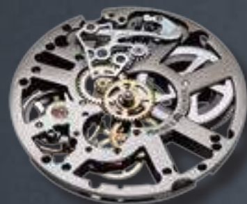
CALIBRE ML 134 MASTERPIECE SQUELETTE