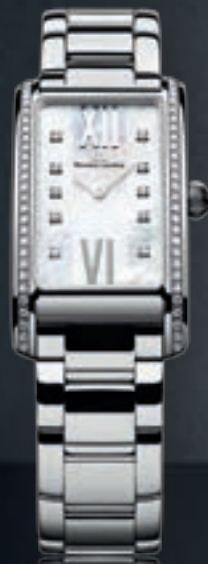
N°150.1 FIABA FA2164-SD532-170 Quartz movement, 20.9/39 mm stainless steel diamond set case.