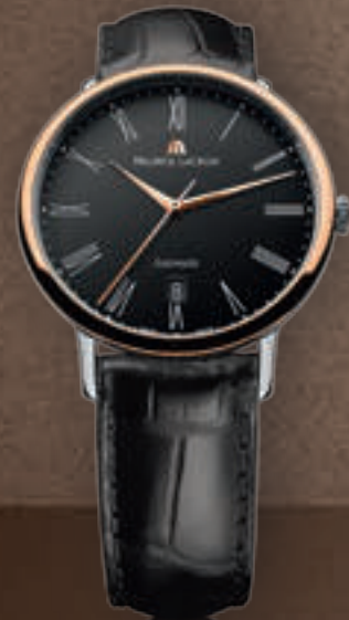
N°96.2 TRADITION LC6067-PS101-310 Automatic movement, Ø 38 mm stainless steel case / 18K pink gold bezel.