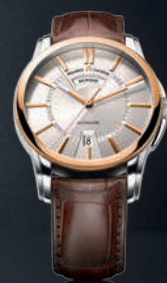
N°83.4 DAY/DATE PT6158-PS101-13E Automatic movement, Ø 40 mm stainless steel / 18K pink gold bezel.