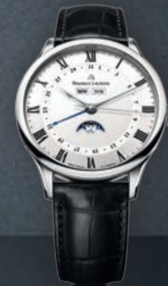
N°45.4 PHASES DE LUNE MP6607-SS001-112 Automatic movement, Ø 40 mm stainless steel case.