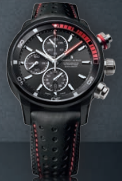
N°59.1 PONTOS S EXTREME PT6028-ALB01-331 Automatic movement, Ø 43 mm aluminium / titanium case. Designed by Henrik Fisker. Limited Edition 999 pces.