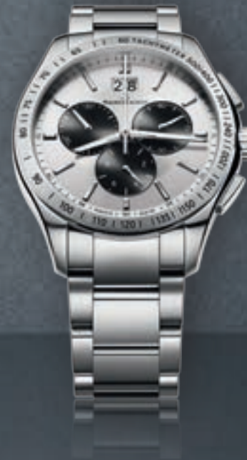
N°111.3 CHRONOGRAPHE MI1028-SS002-130 Quartz movement, Ø 41 mm stainless steel case.