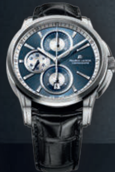
N°68.1 CHRONOGRAPHE PT6188-SS001-430 Automatic movement, Ø 43 mm stainless steel case.