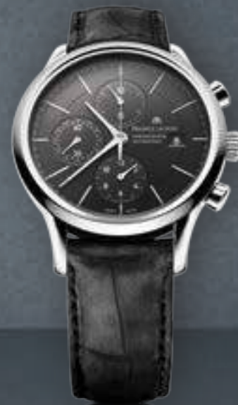
N°93.2 CHRONOGRAPHE LC6058-SS001-330 Automatic movement, Ø 41 mm stainless steel case.