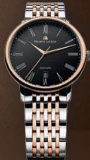
N°97.4 TRADITION LC6067-PS103-310 Automatic movement, Ø 38 mm stainless steel case / 18K pink gold bezel.