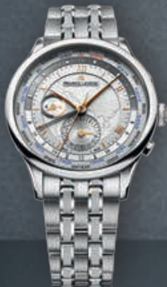
N°36.2 WORLDTIMER MP6008-SS002-110 Automatic movement, Ø 42 mm stainless steel case.