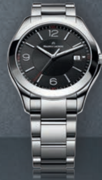
N°115.2 DATE MI1018-SS002-330 Quartz movement, Ø 40 mm stainless steel case.