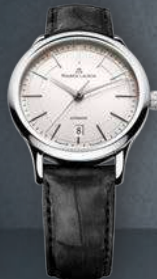
N°99.1 DATE LC6017-SS001-130 Automatic movement, Ø 38 mm stainless steel case.

Stripped to the basics to capture the very essence of time the Les Classiques Date speaks of a high level of sophistication in a minimal, modest tone. Effortlessly capturing the timeless spirit of horology in its purest form.