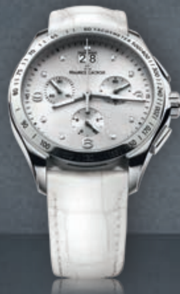
N°126.2 CHRONOGRAPHE MI1057-SS001-150 Quartz movement, Ø 38 mm stainless steel case.