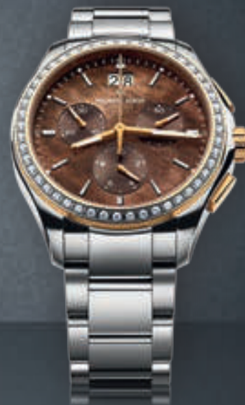
N°126.3 CHRONOGRAPHE MI1057-PVP22-760 Quartz movement, Ø 38 mm stainless steel diamond set case / pink gold PVD bezel.

The Miros Chronographe exudes confidence. It doesn't need to shout about how great it is, it just is. Its understated design whispers of its power. Water resistant to 100m, this is a watch for those that believe actions speak louder than words.