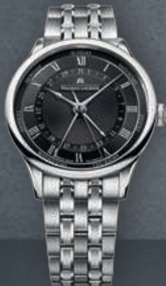
N°40.2 5 AIGUILLES MP6507-SS002-310 Automatic movement, Ø 40 mm stainless steel case.