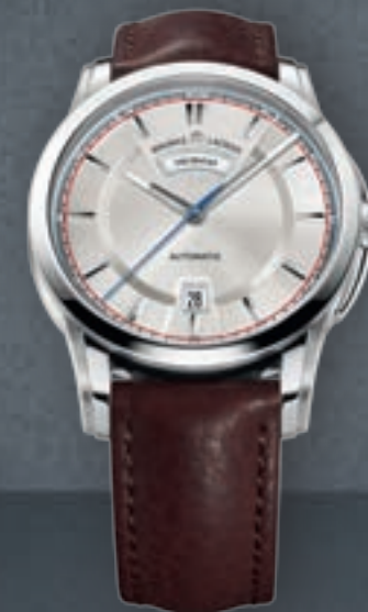
N°79.1 DAY/DATE PT6158-SS001-131 Automatic movement, Ø 40mm stainless steel case.

With its attractive design and additional features the Pontos Day/Date presents timekeeping in its purest form. The discreet date aperture at 6 o'clock is perfectly balanced by a day of the week display at 12, creating an esthetically pleasing contrast on the classically executed dial.