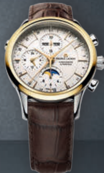
N°88.4 CHRONOGRAPHE PHASES DE LUNE LC6078-YS101-13E Automatic movement, Ø 41 mm stainless steel case / 18K yellow gold bezel