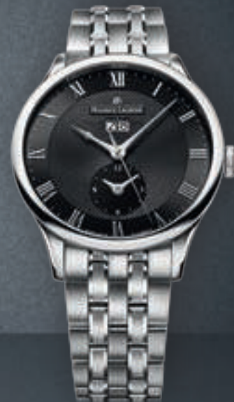
N°46.2 GRAND DATE GMT MP6707-SS002-310 Automatic movement, Ø 40mm stainless steel case.