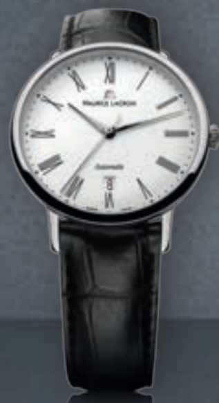
N°94.3 TRADITION LC6067-SS001-110 Automatic movement, Ø 38 mm stainless steel case.