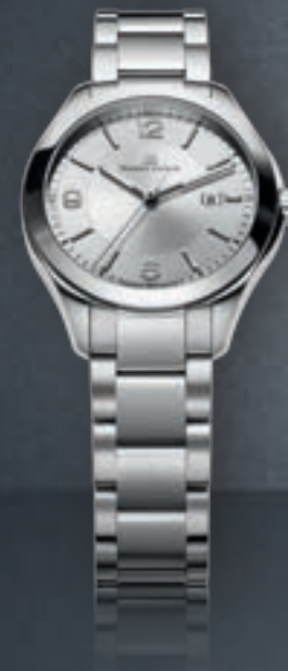
N°131.1 DATE MI1014-SS002-130 Quartz movement, Ø 32 mm stainless steel case.