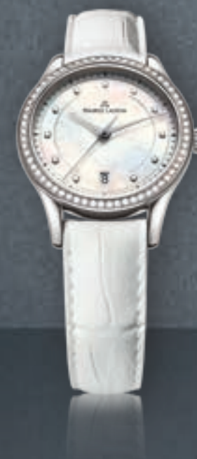
N°139.2 DATE LC1026-SD501-170 Quartz movement, Ø 33 mm stainless steel diamond set case.