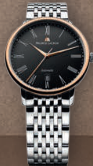
N°97.2 TRADITION LC6067-PS102-310 Automatic movement, Ø 38 mm stainless steel case / 18K pink gold bezel.