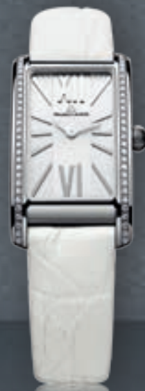
N°150.3 FIABA FA2164-SD531-114 Quartz movement, 20.9/39 mm stainless steel diamond set case.