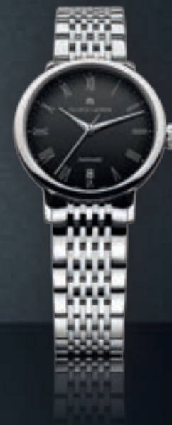
N°145.2 TRADITION LC6063-SS002-310 Automatic movement, Ø 28 mm stainless steel case.