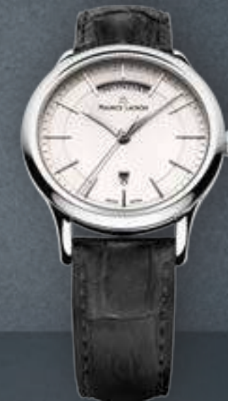
N°105.2 DAY/DATE LC1007-SS001-130 Quartz movement, Ø 38 mm stainless steel case.