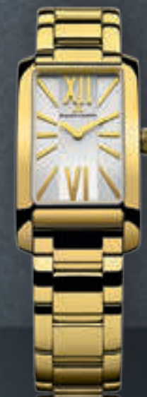
N°153.4 FIABA FA2164-PVY06-112 Quartz movement, 20.9/39 mm stainless steel yellow PVD coated case.