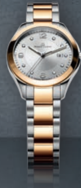
N°131.3 DATE MI1014-PVP13-150 Quartz movement, Ø 32 mm stainless steel case / pink gold PVD coated bezel.