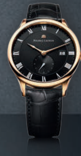
N°53.4 PETITE SECONDE MP6907-PG101-311 Automatic movement, Ø 40 mm 18k pink gold case. Limited Edition 88 pcs.