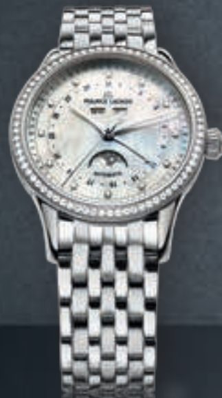
N°142.2 PHASES DE LUNE LC6057-SD502-17E Automatic movement, Ø 38 mm stainless steel diamond set case.