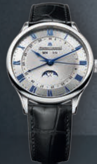
N°45.1 PHASES DE LUNE MP6607-SS001-110 Automatic movement, Ø 40 mm stainless steel case.

For some times goes beyond simply counting hours. With the Masterpiece Phases de Lune you can keep track of time whilst contemplating the influential effects of the moon. Featuring an exquisite moon phase indication at 6 o'clock, this classically designed timepiece offers a level of sophistication that is out of this world.