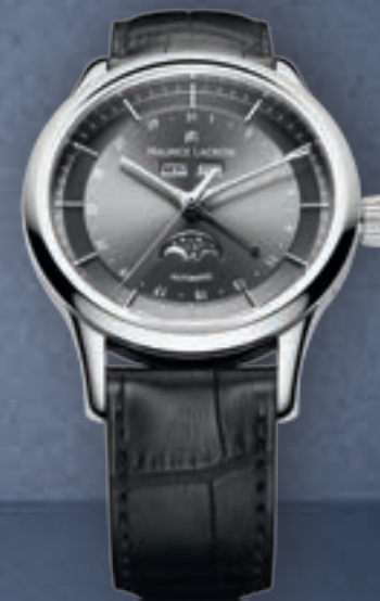
N°91.3 PHASES DE LUNE LC6068-SS001-331 Automatic movement, Ø 40 mm stainless steel case.