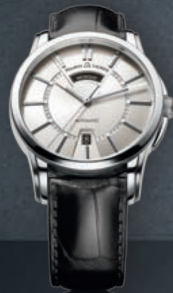
N°82.2 DAY/DATE PT6158-SS001-13E Automatic movement, Ø 40 mm stainless steel case.