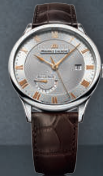
N°49.3 RESERVE DE MARCHE MP6807-SS001-111 Automatic movement, Ø 40 mm stainless steel case.