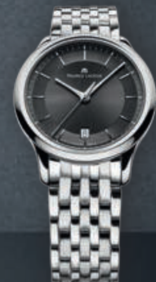
N°107.4 DATE LC1237-SS002-330 Quartz movement, Ø 38 mm stainless steel case.