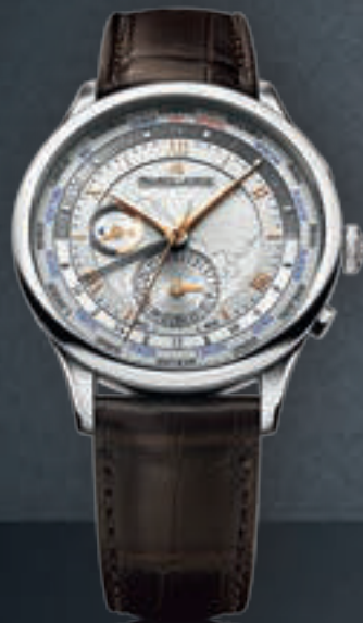
N°36.1 WORLDTIMER MP6008-SS001-110 Automatic movement, Ø 42 mm stainless steel case.