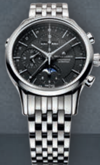
N°88.3 CHRONOGRAPHE PHASES DE LUNE LC6078-SS002-33E Automatic movement, Ø 41 mm stainless steel case.