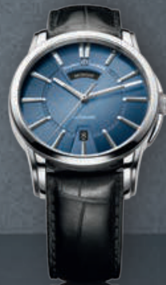
N°83.2 DAY/DATE PT6158-SS001-43E Automatic movement, Ø 40 mm stainless steel case.