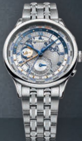
N°36.4 WORLDTIMER MP6008-SS002-111 Automatic movement, Ø 42 mm stainless steel case.