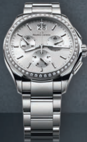
N°126.1 CHRONOGRAPHE MI1057-SD502-130 Quartz movement, Ø 38 mm stainless steel case.