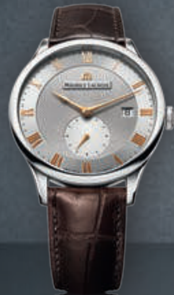
N°50.1 PETITE SECONDE MP6907-SS001-111 Automatic movement, Ø 40 mm stainless steel case.

A classic design that likes to display its sporty side. The Masterpiece Petite Seconde combines the elegance of roman numerals with a small, almost sporty, seconds counter. Positioned at 6 o'clock it gives a sense of modern urgency to this immaculately finished timepiece.