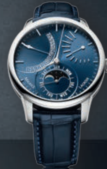
N°33.3 LUNE RETROGRADE

Automatic manufacture movement ML192, Ø 43 mm stainless steel case.