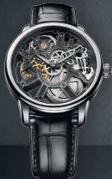
N°30.1 SQUELETTE MP7228-SS001-000 Hand-wound manufacture movement ML 134, Ø 43 mm stainless steel case.

The Masterpiece Squelette respects the heritage of traditional watch making, while exhibiting a modern, avant-garde flair. The workings of the skeleton movement reflect a painstaking level of craftsmanship and precision that is beautifully displayed by the sapphire crystal case back.