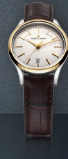
N°139.4 DATE LC1026-PVY11-130 Quartz movement, Ø 33 mm stainless steel case / yellow gold PVD coated bezel.