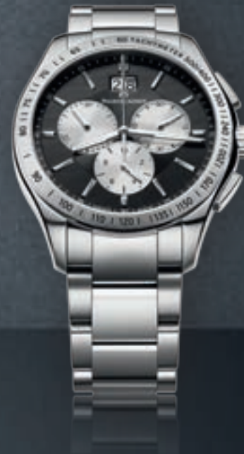
N°111.4 CHRONOGRAPHE MI1028-SS002-332 Quartz movement, Ø 41 mm stainless steel case.