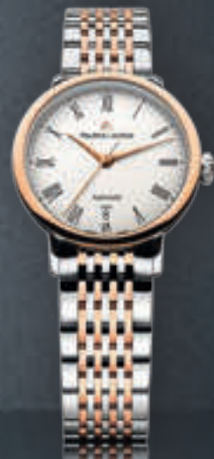
N°147.3 TRADITION LC6063-PS103-110 Automatic movement, Ø 28 mm stainless steel case/18K pink gold bezel.