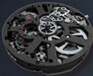
CALIBRE ML 106-7 MASTERPIECE LE CHRONOGRAPHE SQUELETTE

With numerous awards, patents and designs for new movements and complications, our watches aren't just perfect in form but also in function.