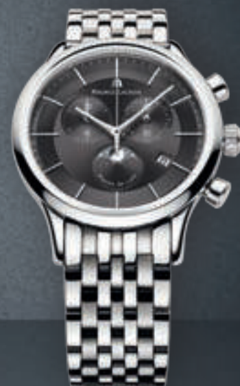
N°100.2 CHRONOGRAPHE PHASES DE LUNE LC1148-SS002-331 Quartz movement, Ø 40 mm stainless steel case.