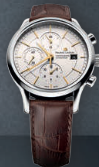
N°93.3 CHRONOGRAPHE LC6058-SS001-131 Automatic movement, Ø 41 mm stainless steel case.