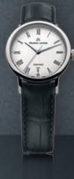
N°145.1 TRADITION LC6063-SS001-110 Automatic movement, Ø 28 mm stainless steel case.