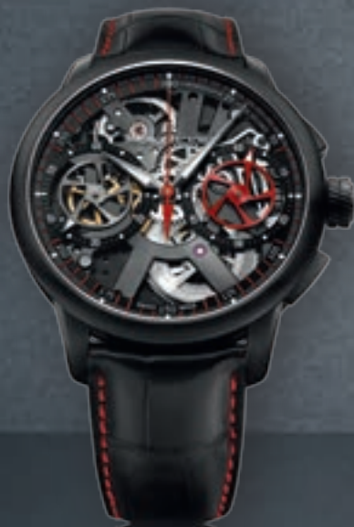
N°28.2 LE CHRONOGRAPHE SQUELETTE

MP7128-SS001-500 Hand-wound manufacture movement ML106, Ø 45 mm stainless steel case. Limited Edition 188 pces.