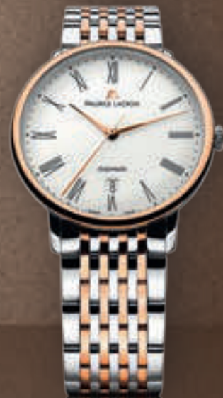
N°97.3 TRADITION LC6067-PS103-110 Automatic movement, Ø 38 mm stainless steel case / 18K pink gold bezel.