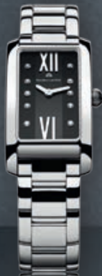
N°150.2 FIABA FA2164-SS002-350 Quartz movement, 20.9/39 mm stainless steel case.