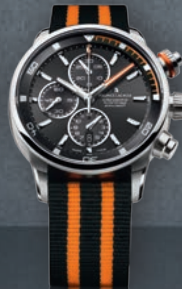
N°65.2 PONTOS S PT6008-SS002-332 Automatic movement, Ø 43 mm stainless steel case.