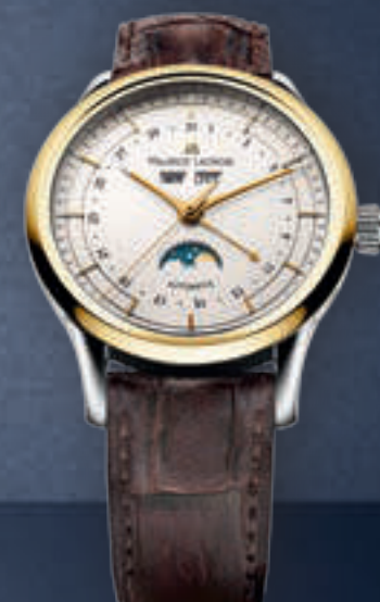
N°91.4 PHASES DE LUNE LC6068-YS101-13E Automatic movement, Ø 40 mm stainless steel case / 18K yellow gold bezel.