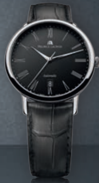
N°94.4 TRADITION LC6067-SS001-310 Automatic movement, Ø 38 mm stainless steel case.