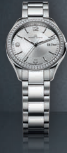
N°129.1 DATE MI1014-SD502-130 Quartz movement, Ø 32 mm stainless steel diamond set case.

These days simplicity is a rare quality, but the Miros Date has it in abundance. A refreshing lack of gimmickery allows this watch to simply work. It's sophisticated, confident and straight forward, just like those who wear it.