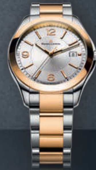
N°115.3 DATE MI1018-PVP13-130 Quartz movement, Ø 40 mm stainless steel case / 18K pink gold plated bezel.