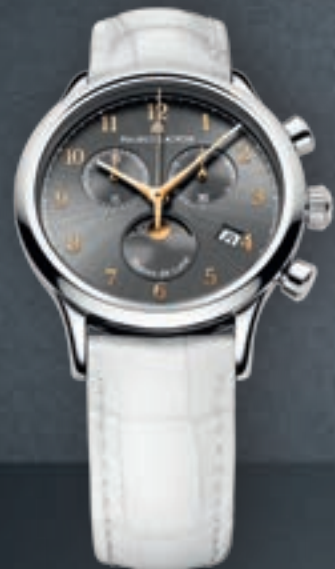
N°134.1 PHASES DE LUNE CHRONOGRAPHE

LC1087-SS001-821 Quartz movement, Ø 38 mm stainless steel case.