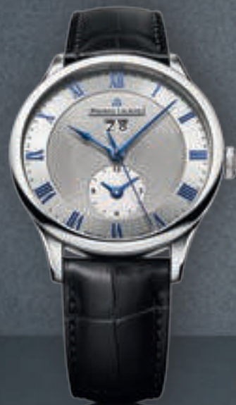
N°46.1 GRAND DATE GMT MP6707-SS001-110 Automatic movement, Ø 40mm stainless steel case.

Two faces of time working hand-in-hand. The Masterpiece Date GMT features a subtle date display and secondary time zone to seamlessly combine elements of classical design with more modern functions. Offering the perfect composition of simplicity and grandeur.