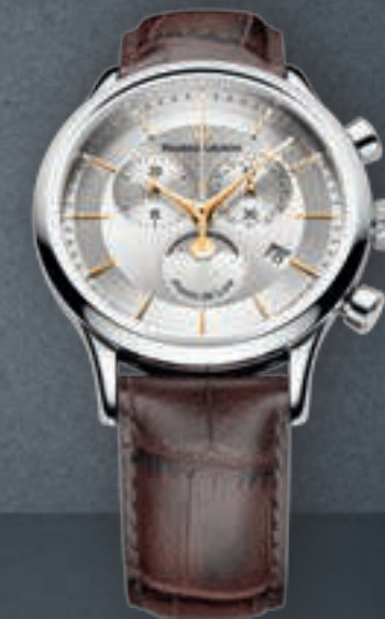
N°101.1 CHRONOGRAPHE PHASES DE LUNE LC1148-SS001-132 Quartz movement, Ø 40 mm stainless steel case.