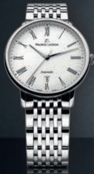
N°94.1 TRADITION LC6067-SS002-110 Automatic movement, Ø 38 mm stainless steel case.