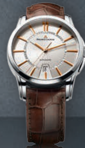
N°85.3 DATE PT6148-SS001-131 Automatic movement, Ø 40mm stainless steel case.