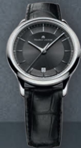
N°107.3 DATE LC1237-SS001-330 Quartz movement, Ø 38 mm stainless steel case.