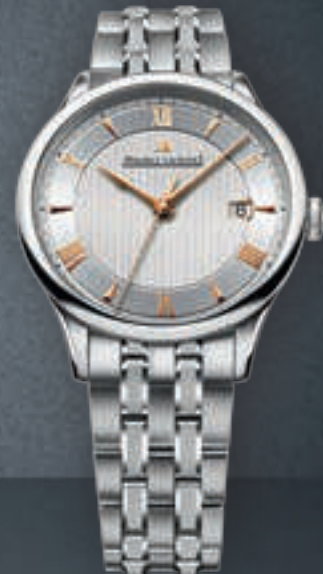
N°54.2 DATE MP6407-SS002-110 Automatic movement, Ø 38 mm stainless steel case.