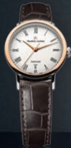
N°146.1 TRADITION LC6063-PS101-110 Automatic movement, Ø 28 mm stainless steel case/18K pink gold bezel.