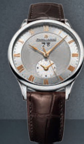
N°47.1 GRAND DATE GMT MP6707-SS001-111 Automatic movement, Ø 40mm stainless steel case.