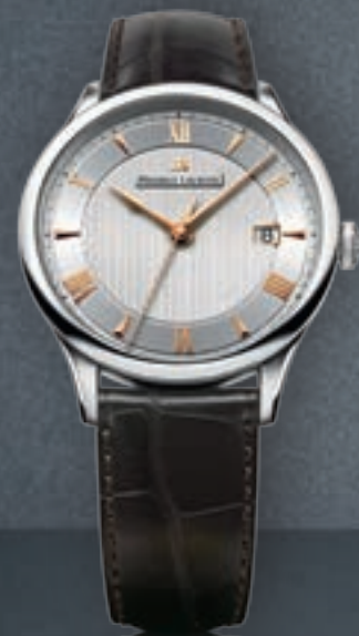
N°54.1 DATE MP6407-SS001-110 Automatic movement, Ø 38 mm stainless steel case.

A simple design characterized by classic appeal. The Masterpiece Date is stripped to the essentials to create a surprisingly natural esthetic. The elegant roman numerals are complimented by a subtle date display to create a pure example of fine watch making.