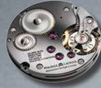
CALIBRE ML 153 MASTERPIECE REGULATEUR ROUE CARREE