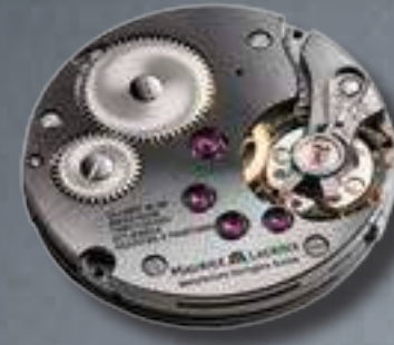
CALIBRE ML 152 MASTERPIECE LUNE RETROGRADE