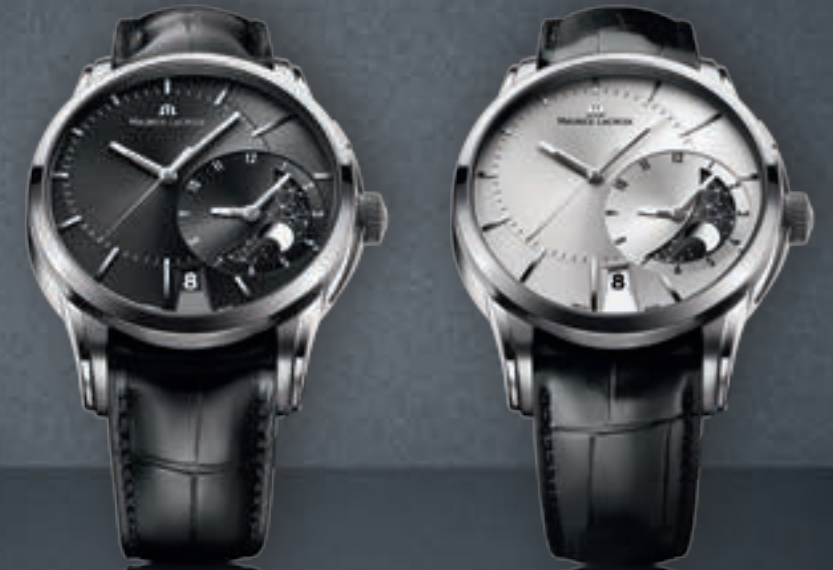
N°73.1 DECENTRIQUE GMT

A contemporary design that redefines the notion of time, the Pontos Decentrique GMT, with its dual-time zones, showcases the unique off-centre dial pioneered by Maurice Lacroix. Each element of the watch reveals a different aspect of time, creating an interplay of movement that is truly mesmerizing.