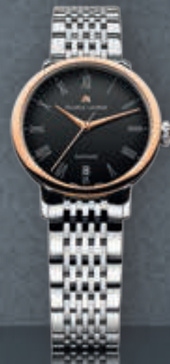
N°147.2 TRADITION LC6063-PS102-310 Automatic movement, Ø 28 mm stainless steel case/18K pink gold bezel.