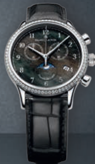
N°134.3 PHASES DE LUNE CHRONOGRAPHE

LC1087-SD501-820 Quartz movement, Ø 38 mm stainless steel diamond set case.