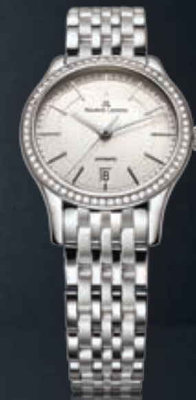
N°143.3 DATE LC6016-SD502-130 Automatic movement, Ø 33 mm stainless steel diamond set case.