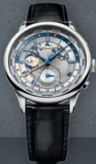
N°36.3 WORLDTIMER MP6008-SS001-111 Automatic movement, Ø 42 mm stainless steel case.