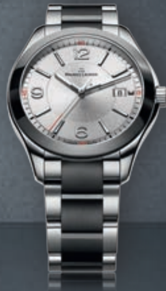
N°112.2 DATE MI1018-SS002-131 Quartz movement, Ø 40 mm black/stainless steel case.