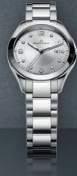
N°129.3 DATE MI1014-SS002-150 Quartz movement, Ø 32 mm stainless steel case.