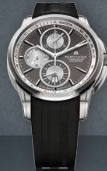
N°71.2 CHRONOGRAPHE PT6188-TT031-830

Automatic movement, Ø 43 mm stainless steel/black ceramic coated case.