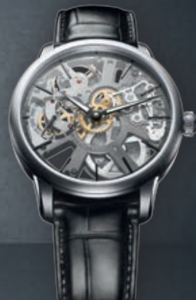
N°31.1 SQUELETTE MP7228-SS001-030 Hand-wound manufacture movement ML 134, Ø 43mm stainless steel case.