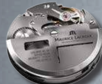
CALIBRE ML 191 MASTERPIECE DOUBLE RETROGRADE