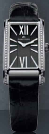
N°150.4 FIABA FA2164-SD531-311 Quartz movement, 20.9/39 mm stainless steel diamond set case.

The distinguished rectangular shape of the Fiaba forms a perfect frame for the delicate diamond encrusted dial with classic roman numerals. The gently curved profile hugs the contour of the arm to create an impression that is as charming as the wearer.