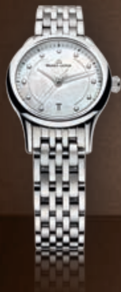
N°140.1 DATE LC1113-SS002-170 Quartz movement, Ø 28 mm stainless steel case.