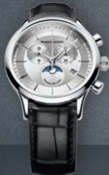
N°100.1 CHRONOGRAPHE PHASES DE LUNE LC1148-SS001-131 Quartz movement, Ø 40 mm stainless steel case.

The Chronographe Phases de Lune is a classically designed chronograph with additional moon phase display. The three counters encapsulate both the precise and whimsical sides of time, to create a harmony that echoes the simplistic design.