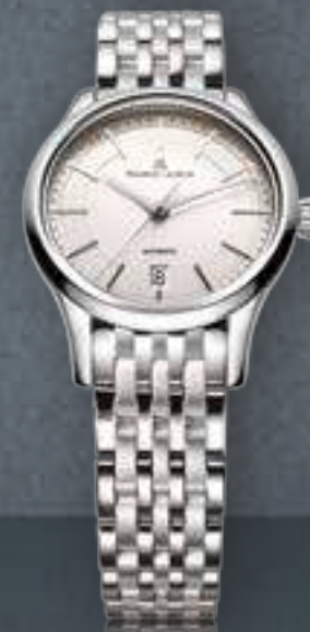
N°143.1 DATE LC6016-SS002-130 Automatic movement, Ø 33 mm stainless steel case.