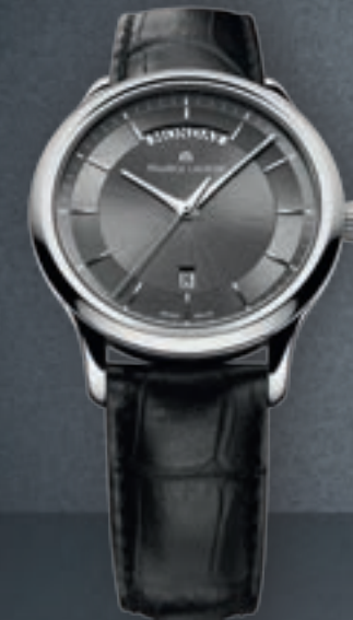
N°105.1 DAY/DATE LC1227-SS001-330 Quartz movement, Ø 38 mm stainless steel case.