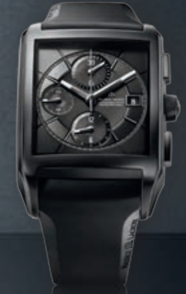
N°71.4 RECTANGULAIRE CHRONOGRAPHE FULL BLACK

Automatic movement, Ø 43 mm titanium case.