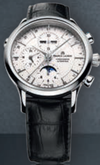
N°88.2 CHRONOGRAPHE PHASES DE LUNE LC6078-SS001-13E Automatic movement, Ø 41 mm stainless steel case.