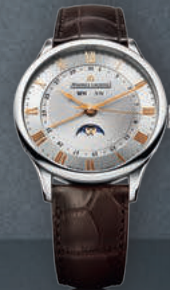
N°45.3 PHASES DE LUNE MP6607-SS001-111 Automatic movement, Ø 40 mm stainless steel case.