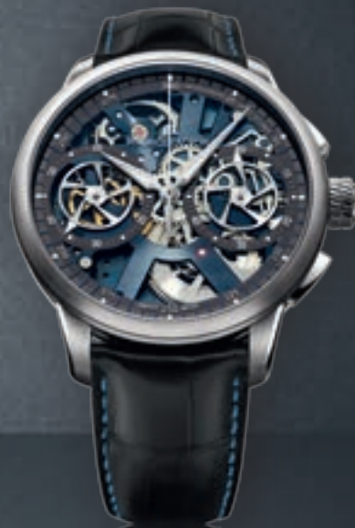
N°28.4 LE CHRONOGRAPHE SQUELETTE

MP7128-SS001-100 Hand-wound manufacture movement ML106, Ø 45 mm stainless steel case. Limited Edition 188 pces.