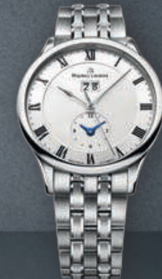
N°47.2 GRAND DATE GMT MP6707-SS002-112 Automatic movement, Ø 40mm stainless steel case.