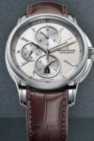
N°69.1 CHRONOGRAPHE PT6188-SS001-130 Automatic movement, Ø 43 mm stainless steel case.