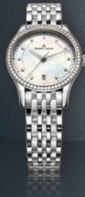
N°139.1 DATE LC1026-SD502-170 Quartz movement, Ø 33 mm stainless steel diamond set case.

With its simple curves and refined touches Les Classiques Date speaks of elegant simplicity. The delicate hour indications and subtle date display create a watch of candid beauty. Like the glamorous icons of the silver screen its graceful appeal stands the test of time.