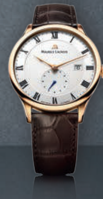
N°53.3 PETITE SECONDE MP6907-PG101-113 Automatic movement, Ø 40 mm 18k pink gold case. Limited Edition 88 pcs.