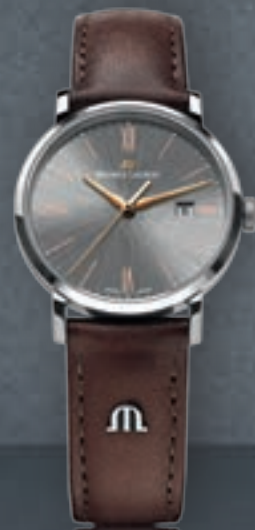
N°156.3 DATE EL1084-SS001-811 Quartz movement, Ø 30 mm stainless steel case.