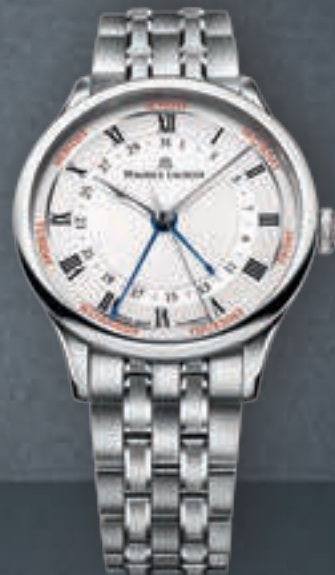
N°40.3 5 AIGUILLES MP6507-SS002-112 Automatic movement, Ø 40 mm stainless steel case.