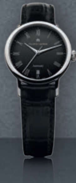
N°144.2 TRADITION LC6063-SS001-310 Automatic movement, Ø 28 mm stainless steel case.