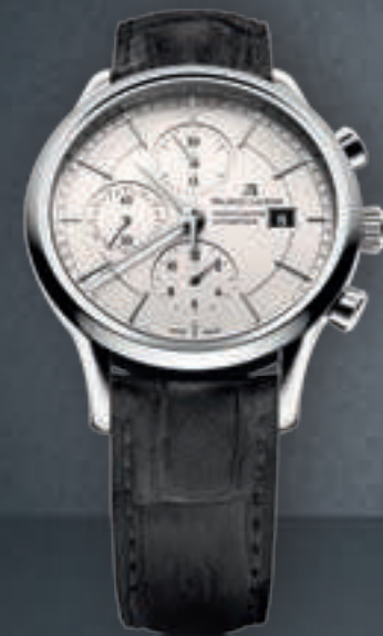
N°93.1 CHRONOGRAPHE LC6058-SS001-130 Automatic movement, Ø 41 mm stainless steel case.

From the understated indexes to the classic placement of the chronograph dials and date aperture, the Les Classiques Chronographe captures the pure sense of reliability and accuracy without having to rely on unnecessary decoration.