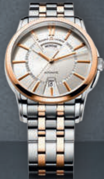
N°80.3 DAY/DATE PT6158-PS103-13E Automatic movement, Ø 40 mm stainless steel/18K pink gold case.