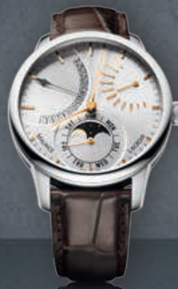
N°33.1 LUNE RETROGRADE

The technically advanced Lune Retrograde charts the waxing and waning of the moon with four complications on a single dial that is as mesmerizing as the heavenly body it represents. With its diamond hands orbiting like glistening stars, the timepiece is as magical and ethereal as the night sky.