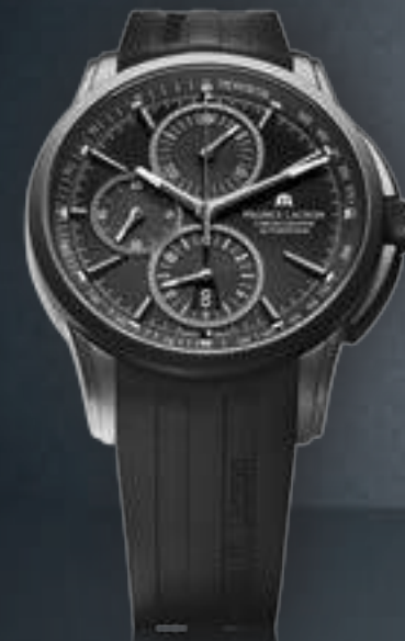
N°71.1 CHRONOGRAPHE FULL BLACK

The Pontos Chronographe Black watches pack the same impressive features as the Pontos Chronographe into a ceramic coated, stainless steel or titanium case with a rubber bracelet. For a subtler, reduced esthetic that doesn't compromise on sporting performance.