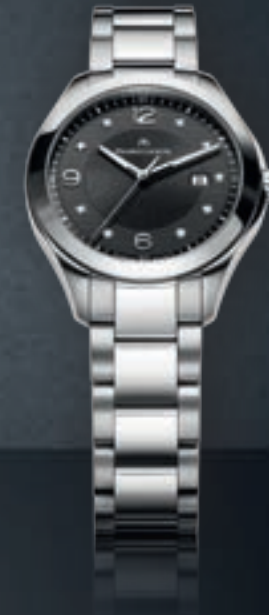
N°129.4 DATE MI1014-SS002-350 Quartz movement, Ø 32 mm stainless steel case.