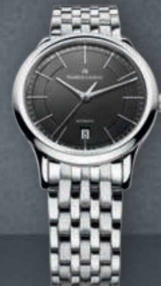
N°99.2 DATE LC6017-SS002-330 Automatic movement, Ø 38 mm stainless steel case.