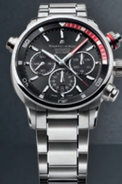
N°65.1 PONTOS S PT6018-SS002-330 Automatic movement, Ø 43 mm stainless steel case.

Clearly influenced by the world of sport the Pontos S adds a touch of dynamism to every day. The choice of two straps that come with every watch gives you an exquisite timepiece that performs while indulging in sports yet doesn't look out of place when dressing up for dinner.