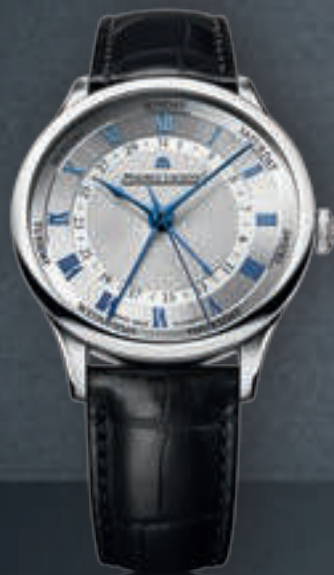
N°40.1 5 AIGUILLES MP6507-SS001-110 Automatic movement, Ø 40 mm stainless steel case.