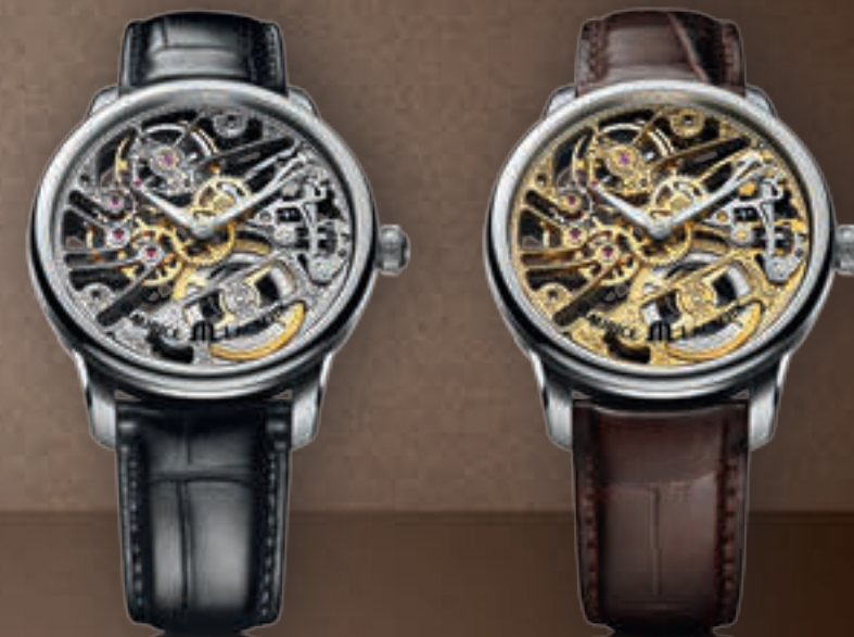
N°39.1 SQUELETTE TRADITION MP7208-SS001-000 Hand-wound manufacture movement, Ø 43 mm stainless steel case.

Take intricate detailing to new depths with the Masterpiece Squelette Tradition. The delicately worked movement, with finely detailed engraving, suggests a passion for tradition whilst the exposed gear chain references a contemporary confidence. This stunning combination of tradition and innovation rewrites the history of watch making without losing touch with the skill of the past.