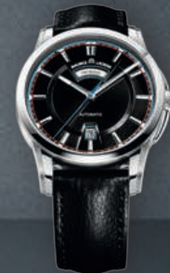
N°79.2 DAY/DATE PT6158-SS001-331 Automatic movement, Ø 40mm stainless steel case.