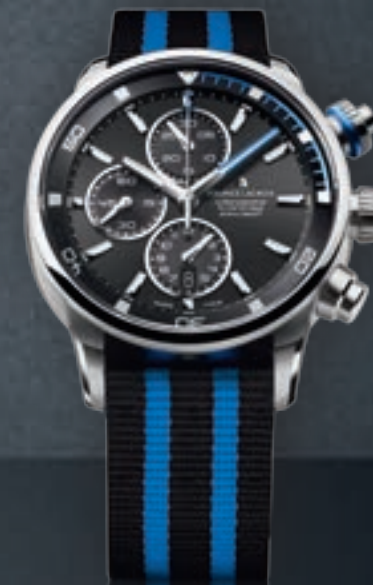
N°65.4 PONTOS S PT6008-SS002-331 Automatic movement, Ø 43 mm stainless steel case.