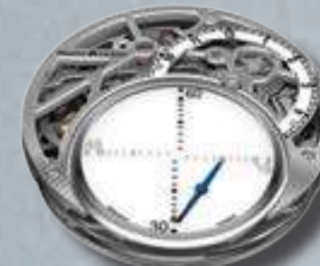
CALIBRE ML 215 MASTERPIECE SECONDE MYSTERIEUSE