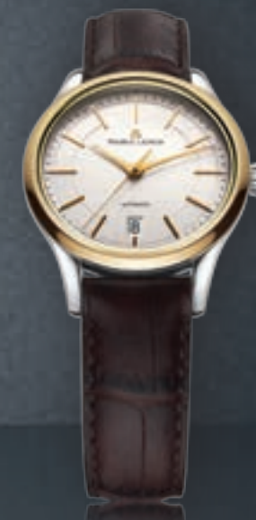
N°143.2 DATE LC6016-YS101-130 Automatic movement, Ø 33 mm stainless steel case/18K yellow gold bezel.