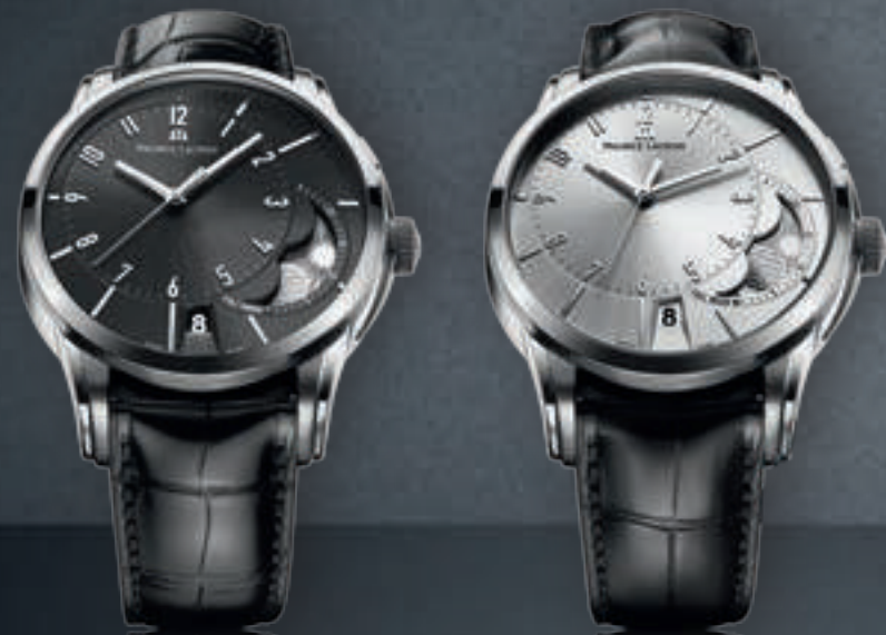
N°74.1 DECENTRIQUE PHASES DE LUNE PT6318-SS001-330 Automatic movement, Ø 43 mm stainless steel case.

The award winning Pontos Decentrique Phases de Lune boasts a range of bold innovations. A single hand tracks the minutes, whilst a flat disc displays hours. Added to this is a distinctive moon-phase indicator to give a magnificent vision of time, dreamt up by the imagination.