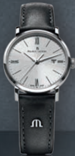
N°156.2 DATE EL1084-SS001-110 Quartz movement, Ø 30 mm stainless steel case.