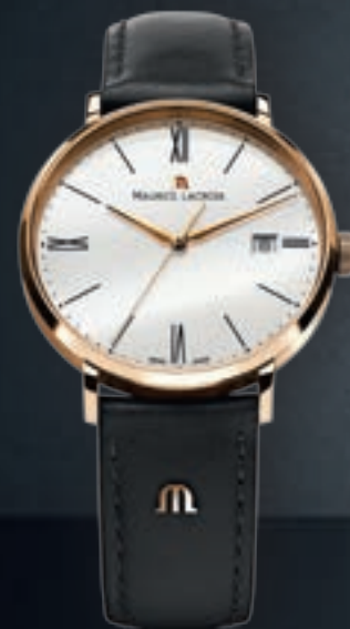
N°120.1 DATE EL1087-PVP01-110 Quartz movement, Ø 38 mm stainless steel case PVD coating in rose gold.