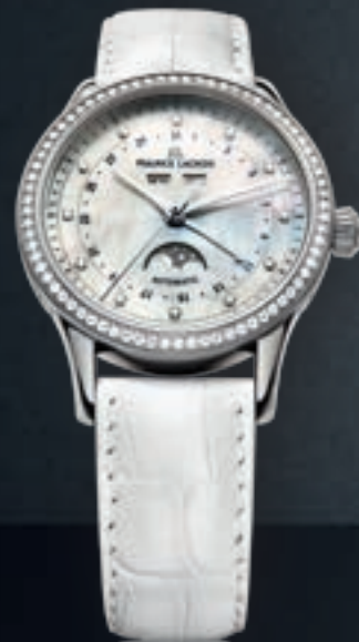
N°142.1 PHASES DE LUNE LC6057-SD501-17E Automatic movement, Ø 38 mm stainless steel diamond set case.

The perfectly proportioned Les Classiques displays a pure natural beauty. The timeless craftsmanship displays an elegant purity, whilst the choice of bezels adds a touch of dazzling glamour.