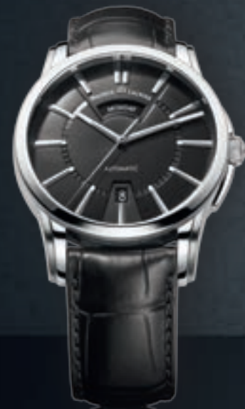
N°82.1 DAY/DATE PT6158-SS001-33E Automatic movement, Ø 40 mm stainless steel case.