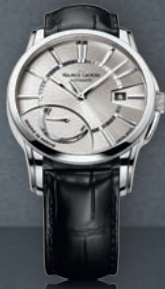
N°76.2 RESERVE DE MARCHE

Automatic movement, Ø 40mm stainless steel case.