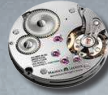
CALIBRE ML 156 MASTERPIECE ROUE CARREE SECONDE