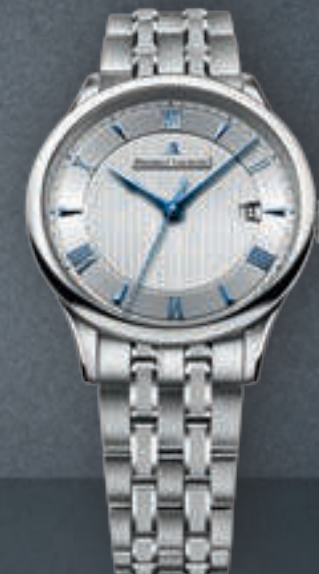
N°55.2 DATE MP6407-SS002-111 Automatic movement, Ø 38 mm stainless steel case.