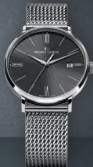
N°120.4 DATE EL1087-SS002-310 Quartz movement, Ø 38 mm stainless steel case.

The Eliros Date focuses on the essentials. The printed indexes and roman numerals mix contemporary and classic styling to create a balanced blend of the new and old. Finished with a subtle date display at 3 o'clock it's everything you'll need from a reliable timepiece with the added bonus of an unmistakable brand signature.