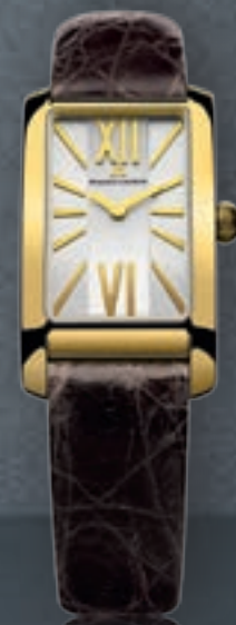
N°153.3 FIABA FA2164-PVY01-112 Quartz movement, 20.9/39 mm stainless steel yellow PVD coated case.