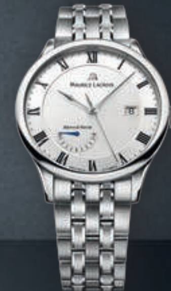
N°49.4 RESERVE DE MARCHE MP6807-SS002-112 Automatic movement, Ø 40 mm stainless steel case.