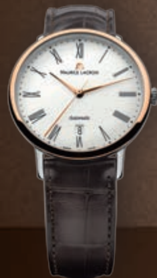
N°96.1 TRADITION LC6067-PS101-110 Automatic movement, Ø 38 mm stainless steel case / 18K pink gold bezel.