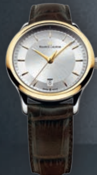
N°107.1 DATE LC1237-PVY11-130 Quartz movement, Ø 38 mm stainless steel case / 18K yellow gold plated bezel.

It all seems too simple. The Les Classiques Date offers a level of stripped down sophistication that simply cannot be ignored. The applied hour marks and subtle date display add to the sense of toned down refinement that both draws from and celebrates the purest forms of watch making.