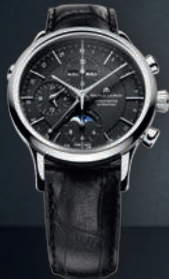
N°88.1 CHRONOGRAPHE PHASES DE LUNE LC6078-SS001-33E Automatic movement, Ø 41 mm stainless steel case.

LES CLASSIQUES | CHRONOGRAPHE PHASES DE LUNE