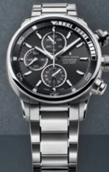
N°65.3 PONTOS S PT6008-SS002-330 Automatic movement, Ø 43 mm stainless steel case.