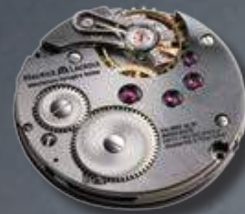
CALIBRE ML 151 MASTERPIECE DOUBLE RETROGRADE