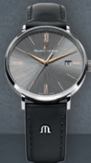
N°120.3 DATE EL1087-SS001-811 Quartz movement, Ø 38 mm stainless steel case.