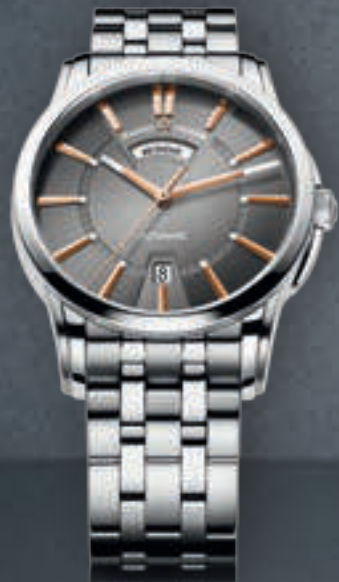
N°80.2 DAY/DATE PT6158-SS002-03E Automatic movement, Ø 40 mm stainless steel case.