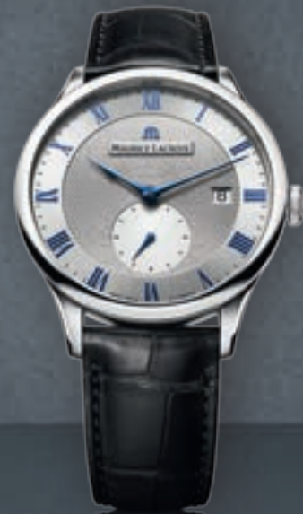
N°50.2 PETITE SECONDE MP6907-SS001-110 Automatic movement, Ø 40 mm stainless steel case.