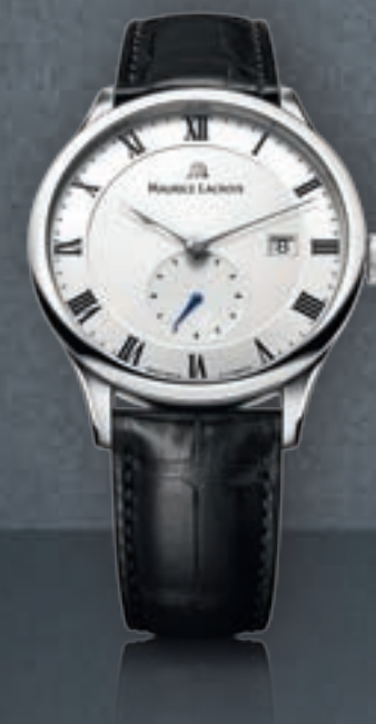
N°53.2 PETITE SECONDE MP6907-SS001-112 Automatic movement, Ø 40 mm stainless steel case.