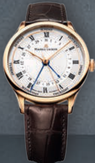
N°42.2 5 AIGUILLES MP6507-PG101-110 Automatic movement, Ø 40 mm 18k pink gold case. Limited Edition 88 pcs.