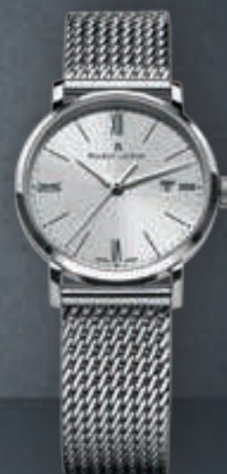
N°156.4 DATE EL1084-SS002-110 Quartz movement, Ø 30 mm stainless steel case.

The Eliros Date exudes classical appeal thanks to its contemporary clean lines and retro appeal. The understated design is perfectly complemented by a high-quality Swiss movement, while the stylish 'M' logo on the bracelet adds to the unmistakable recognition value.