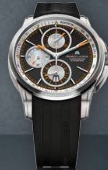
N°71.3 CHRONOGRAPHE PT6188-TT031-330

Automatic movement, Ø 43 mm titanium case.