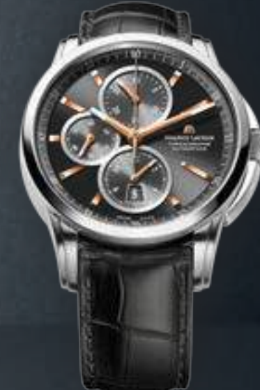
N°69.4 CHRONOGRAPHE PT6188-SS001-332 Automatic movement, Ø 43 mm stainless steel case.