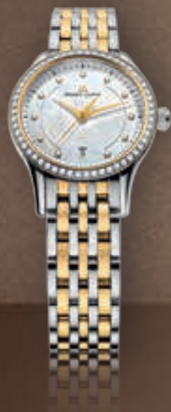
N°140.2 DATE LC1113-PVY23-170 Quartz movement, Ø 28 mm stainless steel diamond set case /yellow gold PVD coated bezel.