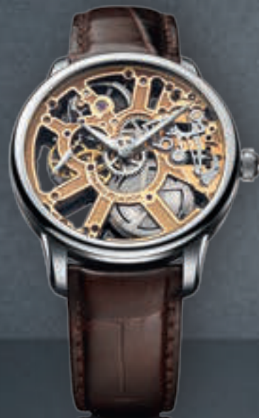
N°30.2 SQUELETTE MP7228-SS001-001 Hand-wound manufacture movement ML 134, Ø 43 mm stainless steel case.