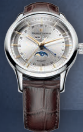
N°91.1 PHASES DE LUNE LC6068-SS001-132 Automatic movement, Ø 40 mm stainless steel case.

Sometimes subtlety can speak volumes. The Les Classiques Phases de Lune structures each point of time in your day, plus every phase of the moon's trajectory, in a sophisticated, orderly fashion that doesn't clutter the pure elegance of the minimalistic face.