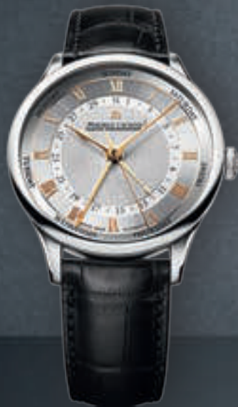
N°42.1 5 AIGUILLES MP6507-SS001-111 Automatic movement, Ø 40 mm stainless steel case.