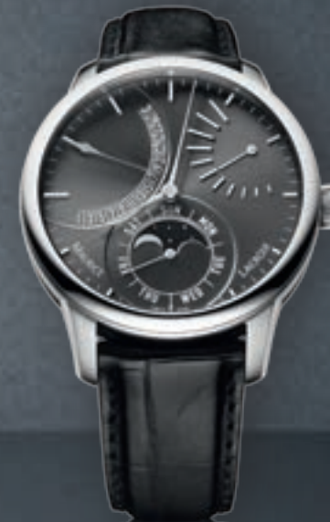
N°33.2 LUNE RETROGRADE

Automatic manufacture movement ML192, Ø 43 mm stainless steel case.