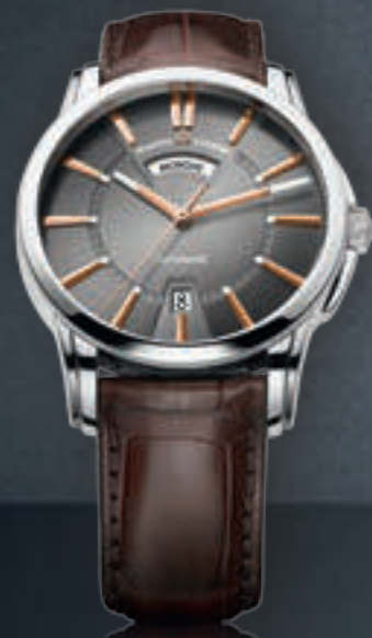
N°80.1 DAY/DATE PT6158-SS001-03E Automatic movement, Ø 40 mm stainless steel case.