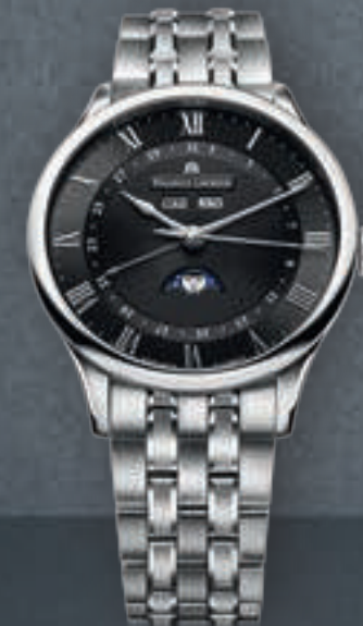
N°45.2 PHASES DE LUNE MP6607-SS002-310 Automatic movement, Ø 40 mm stainless steel case.