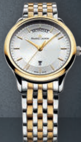
N°104.2 DAY/DATE LC1227-PVY13-130 Quartz movement, Ø 38 mm stainless steel case / 18K yellow gold plated bezel.