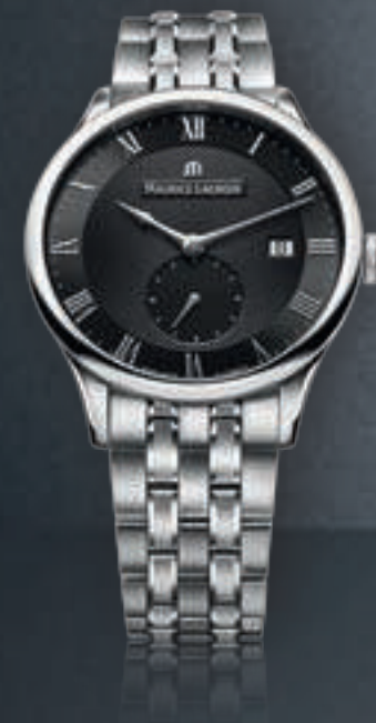
N°53.1 PETITE SECONDE MP6907-SS002-310 Automatic movement, Ø 40 mm stainless steel case.