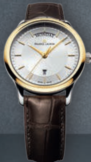
N°104.1 DAY/DATE LC1227-PVY11-130 Quartz movement, Ø 38 mm stainless steel case / 18K yellow gold plated bezel.

With its scaled-down dimensions the Les Classiques Day/Date packs plenty of appeal. The timeless shape and features create a strikingly pure surface that draws the eye to the subtle day and date apertures. A unique timepiece crafted to embody smart sophistication.