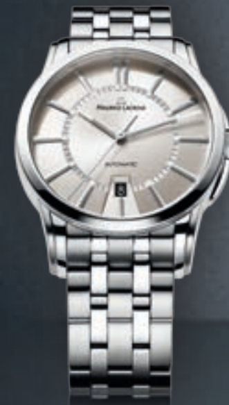
N°85.1 DATE PT6148-SS002-130 Automatic movement, Ø 40mm stainless steel case.