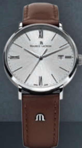
N°120.2 DATE EL1087-SS001-110 Quartz movement, Ø 38 mm stainless steel case.