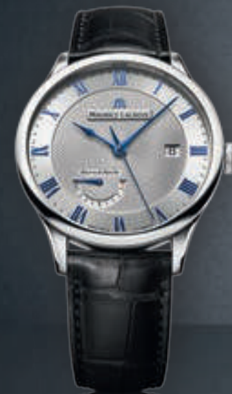
N°49.1 RESERVE DE MARCHE MP6807-SS001-110 Automatic movement, Ø 40 mm stainless steel case.