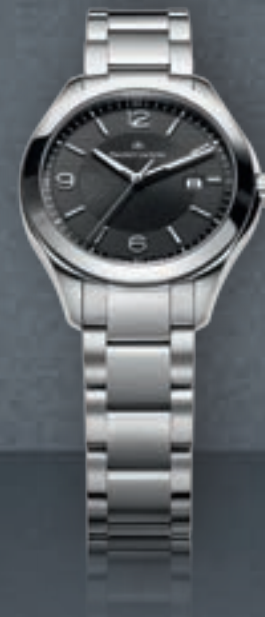
N°131.2 DATE MI1014-SS002-330 Quartz movement, Ø 32 mm stainless steel case.