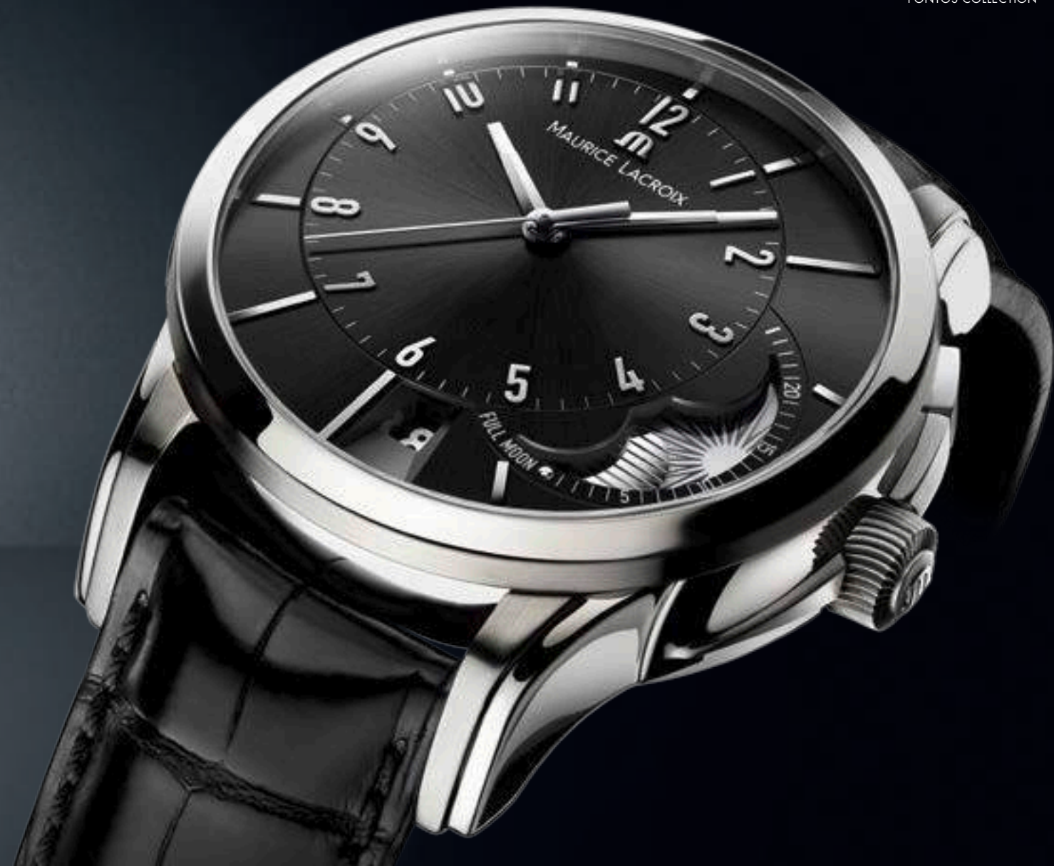
N°74.2 DECENTRIQUE PHASES DE LUNE PT6318-SS001-130 Automatic movement, Ø 43 mm stainless steel case.