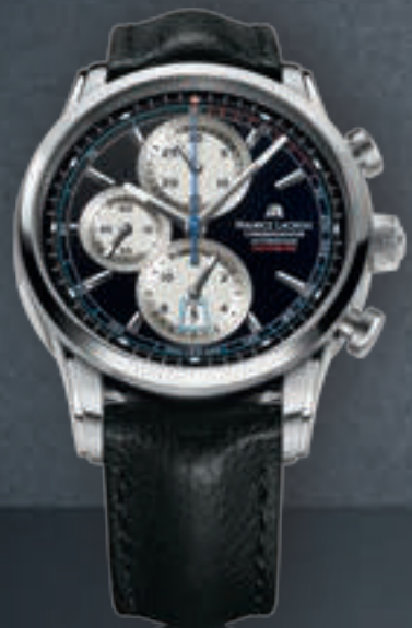
N°66.1 CHRONOGRAPHE PT6288-SS001-330 Automatic movement, Ø 43 mm stainless steel case.