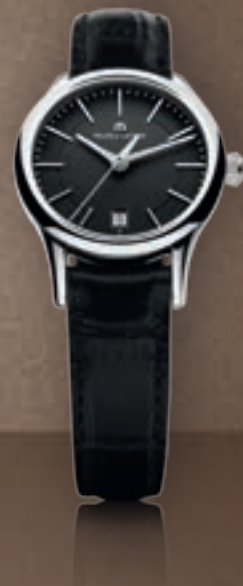
N°140.4 DATE LC1113-SS001-330 Quartz movement, Ø 28 mm stainless steel case.