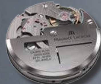
CALIBRE ML 190 MASTERPIECE CALENDRIER RETROGRADE