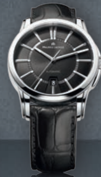
N°85.2 DATE PT6148-SS001-330 Automatic movement, Ø 40mm stainless steel case.