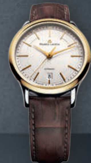
N°99.3 DATE LC6017-YS101-130 Automatic movement, Ø 38 mm stainless steel case/18 K yellow gold bezel.