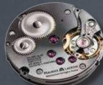
CALIBRE ML 150 MASTERPIECE CALENDRIER RETROGRADE