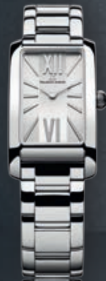
N°153.1 FIABA FA2164-SS002-113 Quartz movement, 20.9/39 mm stainless steel case.

The soft, contemporary lines of the Fiaba display an understated elegance that celebrates the purity of traditional watch making. The slight proportions of the case blend fluidly into the wristband, while the slightly raised hands give a sense of the day gracefully gliding around the dial.