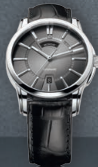
N°83.1 DAY/DATE PT6158-SS001-23E Automatic movement, Ø 40 mm stainless steel case.