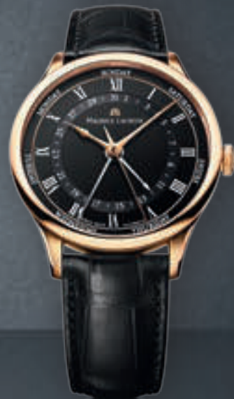
N°42.3 5 AIGUILLES MP6507-PG101-310 Automatic movement, Ø 40 mm 18k pink gold case. Limited Edition 88 pcs.