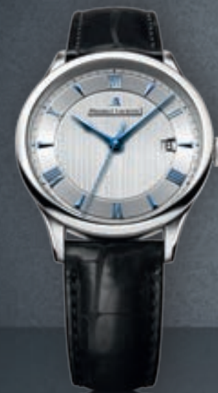
N°55.1 DATE MP6407-SS001-111 Automatic movement, Ø 38 mm stainless steel case.