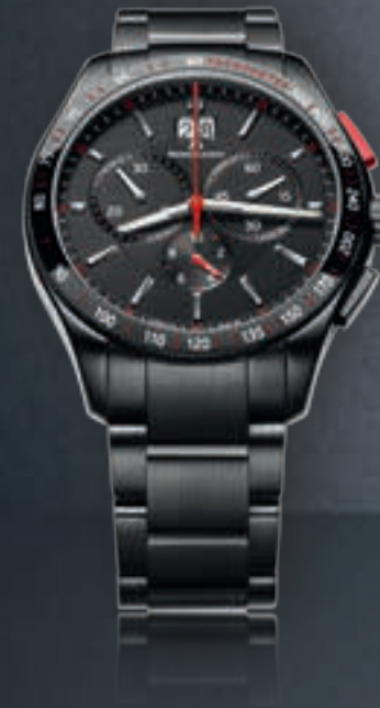
N°111.1 CHRONOGRAPHE MI1028-SS002-330 Quartz movement, Ø 41 mm stainless steel/full black PVD coated case.

With its high performance features and sporty look you may think that the Miros Chronographe is designed to make a loud statement. However, the clean lines and uncomplicated features tell a much different story. This reserved approach to high performance watch making has more in common with poise and elegance than extreme sports.