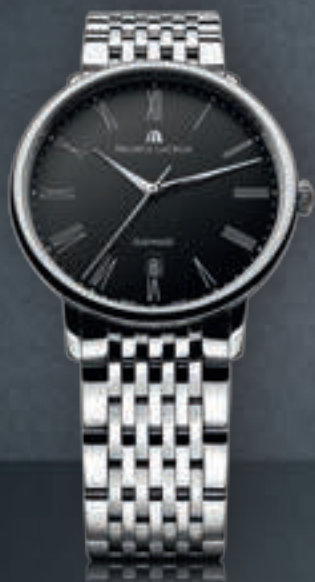
N°94.2 TRADITION LC6067-SS002-310 Automatic movement, Ø 38 mm stainless steel case.