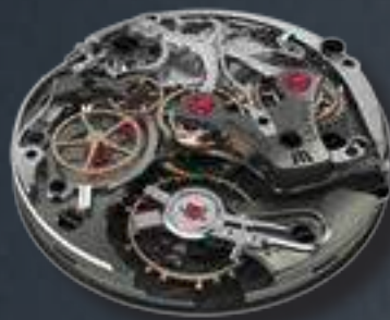
CALIBRE ML 106-2 MASTERPIECE LE CHRONOGRAPHE