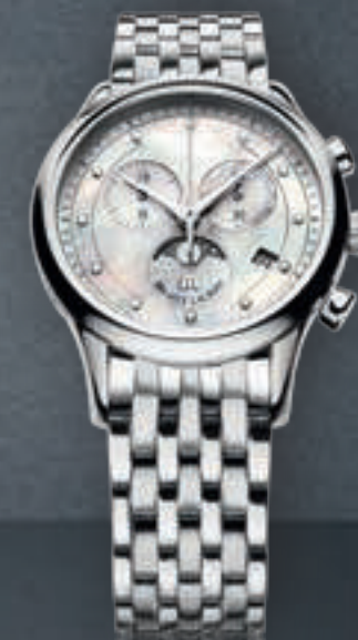
N°137.2 PHASES DE LUNE CHRONOGRAPHE LC1087-SS002-160 Quartz movement, Ø 38 mm stainless steel case.