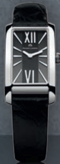
N°153.2 FIABA FA2164-SS001-310 Quartz movement, 20.9/39 mm stainless steel case.