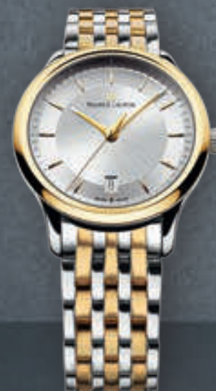
N°107.2 DATE LC1237-PVY13-130 Quartz movement, Ø 38 mm stainless steel case / 18K yellow gold plated bezel.