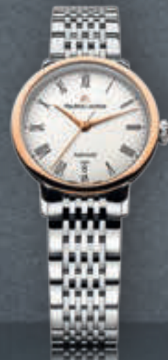
N°147.1 TRADITION LC6063-PS102-110 Automatic movement, Ø 28 mm stainless steel case/18K pink gold bezel.