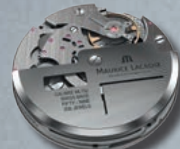
CALIBRE ML 192 MASTERPIECE LUNE RETROGRADE