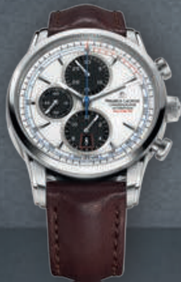
N°66.2 CHRONOGRAPHE PT6288-SS001-130 Automatic movement, Ø 43 mm stainless steel case.