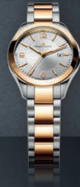
N°131.4 DATE MI1014-PVP13-130 Quartz movement, Ø 32 mm stainless steel case / pink gold PVD coated bezel.